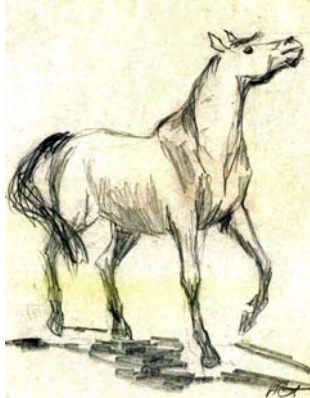
King of the Mountain

fine. I reserve the right to edit for spelling and punctuation—and grammar only if I have to.