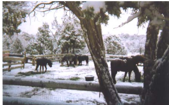
Brrr! The cold weather's on its way.

We particularly need an accountant to help with filing for 501(c)(3), and someone with contacts to help set up a placement program to match up folks who want a horse with other folks who have one they don't want/can't keep. Interested individuals please call Daniel at 970-394-4120.