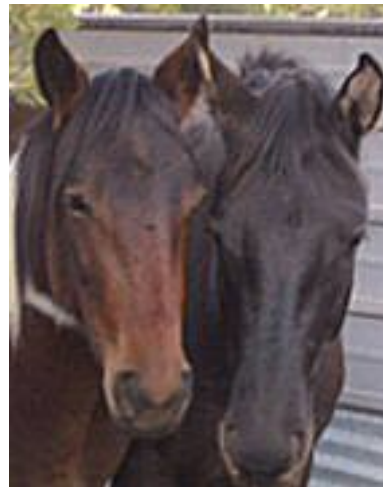
Starbright, a BLM adoptee, and Lady Black, an auction rescue that came to us completely wild but is now halter-broke and trusting of people. Lady is available for adoption.

adequate rest and water in double-decked trailers, forcing them to hold their heads in a bent position causing suffering and injury. The actual method of slaughter was designed for placid cattle, not horses which are natural claustrophobics and therefore face terror and pain as they jump and plunge in a hopeless attempt at escape. Theoretically, “processing” may be “humane,” but in practice it is quite the opposite for horses. Also, since horses are not raised as food animals, they can be full of drugs and chemicals that are not even safe for humans to eat!